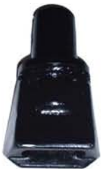
Ceramic Tile Tooth Holder